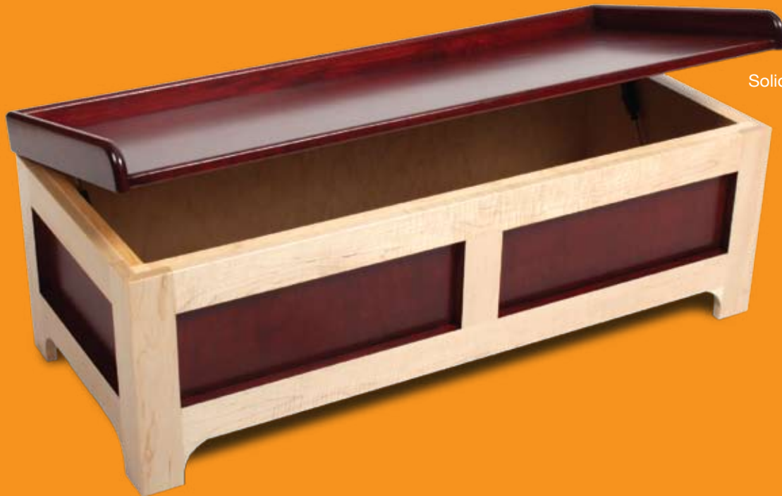
Solid maple with clearcoat and mahogany stain. 48W x 20D x 17H"

BLANKET BOXES ARE A WONDERFUL COMPANION TO ANY BEDROOM SUITE. AS WITH ALL FAMILY HEIRLOOMS, A BLANKET BOX IS A SPECIAL SOMETHING THAT CAN BE PASSED ON TO FUTURE GENERATIONS. DESIGNED IN A VARIETY OF WOODS AND FINISHES, WITH CEDAR LININGS AND HINGED TOPS.